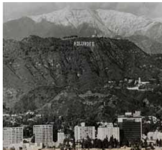
On a clear day you can see...the Hollywood Sign. Restored to glory (1979)