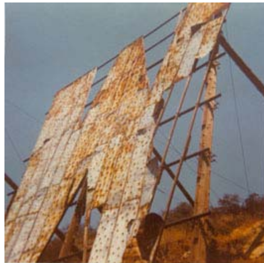
The sign in despair (1973)