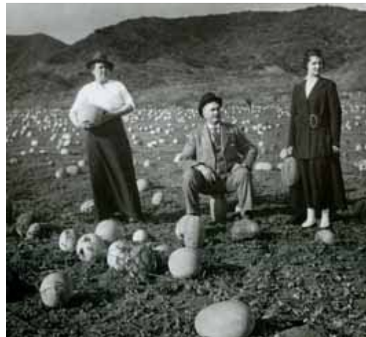
Casaba field at Sunset Blvd. and Harper St. (1918)