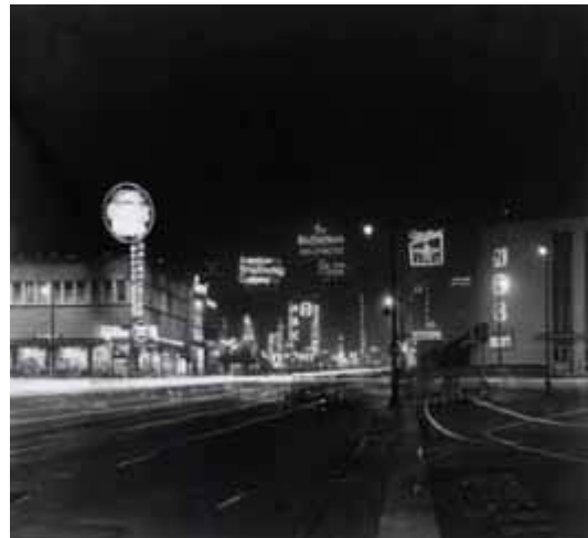
By 1950, Hollywood was the TV capital of the world - KCEA- ABC TV on Vine St. (1953)