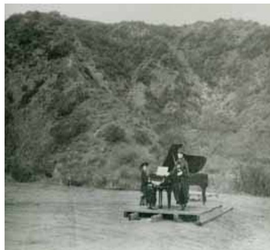
Testing the acoustics at the Hollywood Bowl (1921)