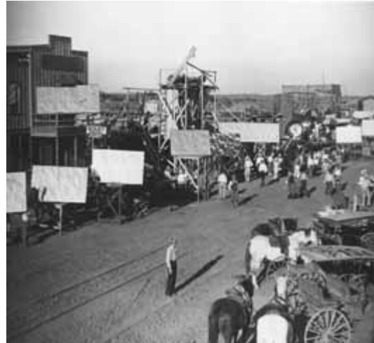
RKO Studios (1931)

addresses, including the opulent Garden Court Apartments, Chateau Elysee and Garden of Allah Villas, were imbued with the glamour of the stars that called them home. The rise of the film aristocracy also meant suave new restaurants and nightclubs up and down Hollywood and Sunset Boulevards. Extravagant movie palaces completed the iconic Hollywood landscape.