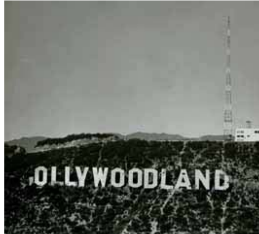
The "ollywoodland" sign (1949)

Around this same time, the Hollywood Sign was undergoing a major transition of its own. In 1949, the Hollywood Chamber of Commerce finally came to the rescue of the ailing Sign, removing the letters that spelled "LAND" and repairing the rest, including the recently toppled "H." As the century hit the halfway mark, a leaner, cleaner Sign was reintroduced in its now-iconic form.