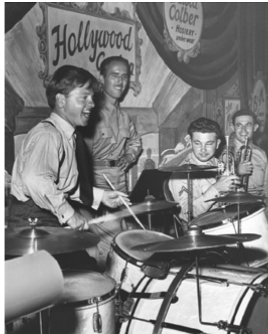
Mickey Rooney at Hollywood Guild Canteen (1943)

By the early 40s, the Hollywoodland real estate development went bust – a casualty of the Depression. The Sign, which hadn’t been maintained in years, quietly became property of the city in 1944. The Sign had made an unheralded transition from billboard to de facto civic landmark, but salvation would have to wait until after the War.