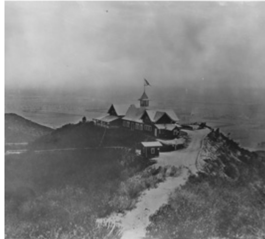
Lookout Mountain Inn in Laurel Canyon (1915)