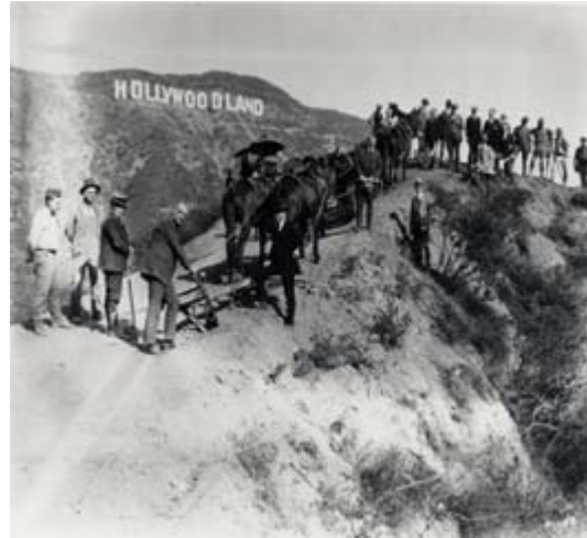
Dedication of the sign (1923)

Originally intended to last just a year and a half, the Sign has endured more than eight decades – and is still going strong.