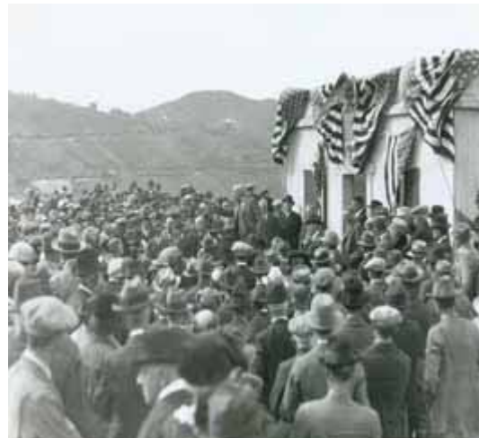
William Mulholland speaking at dedication of Hollywood Lake & Dam (1925)