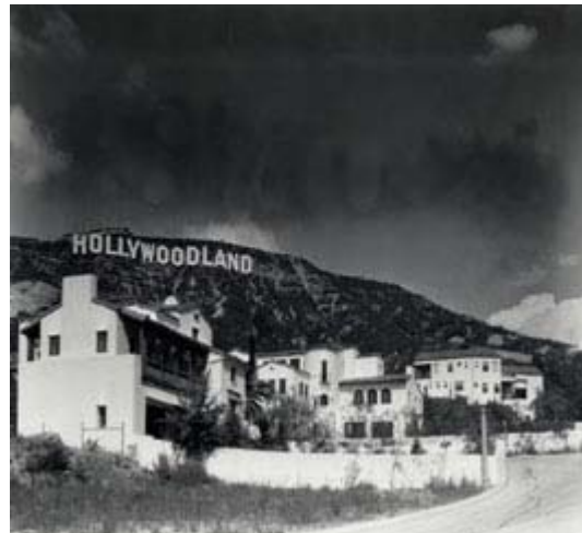
Brand new Hollywoodland homes (1925)