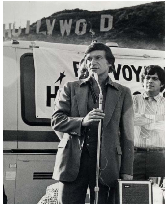
Hugh Hefner comes to the rescue (1978)

In a spellbinding display of lights and megawatts special effects, the nine 45-foot letters of the Hollywood Sign were spectacularly lit, one by one, as L.A. counted down to the 21 st Century. During global Millennium TV coverage, the Sign was featured alongside the Eiffel Tower, Times Square, and the Great Pyramids of Egypt. The erstwhile real estate billboard had taken its place among the world's most revered landmarks.