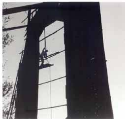
Building an “O” (1923)