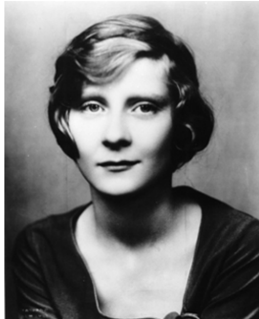
Peg Entwistle, the "Hollywood Sign Girl" (1932)

In a cruel twist of irony, a letter to Peg arrived the day after her death from the Beverly Hills Playhouse. She was offered the lead role in a play ... about a woman driven to suicide.