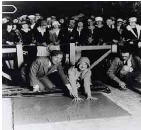
Sid Grauman and Norma Shearer at the Chinese Theatre (1927)