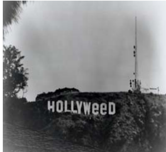
This epic prank belies the conventional wisdom that marijuana stifles initiative (1973)

Adding insult to injury, pranksters altered the Sign's letters to read "Hollyweed" in 1973 (advocating looser marijuana laws) then later, to "Holywood", commemorating a visit from Pope John Paul II in 1987.