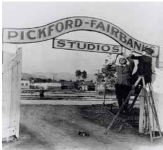
Mary Pickford and Douglas Fairbanks put the finishing touches on their studio on Santa Monica and Formosa (1922)